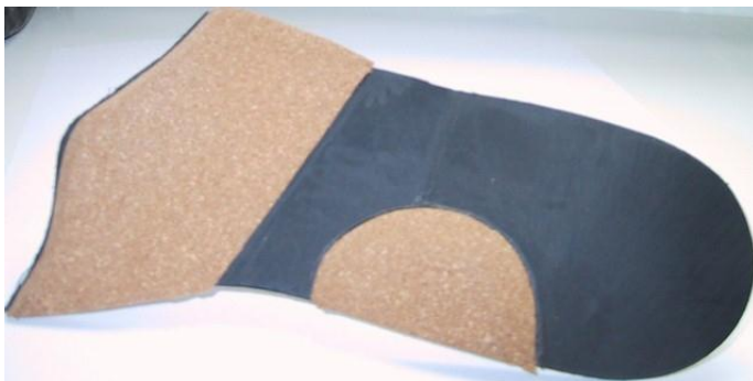
therapie zool volgens Bourdiol

Podopostural Therapy, based on the theory of Dr.R.J.Bourdiol, stimulates the foot sole to a postural correction with patients suffering from all kind of postural complaints as e.g. low back pain, but also with foot- and ankle disorders. According to Bourdiol this stimulation is caused by very thin inserts of cork (1 à 3 mm), glued on a thin insole on an individual base. It was Bourdiol's hypothesis that e.g. such an insert, placed under the medial arch, stimulates directly the nuclear chain- and bagspindle of the m. abductor hallucis which leads consequently to a contraction of this muscle, activated by the \alpha -motorneuron..